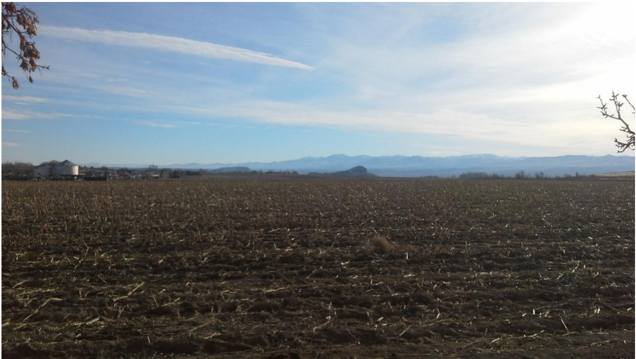
Looking South from Ron's house