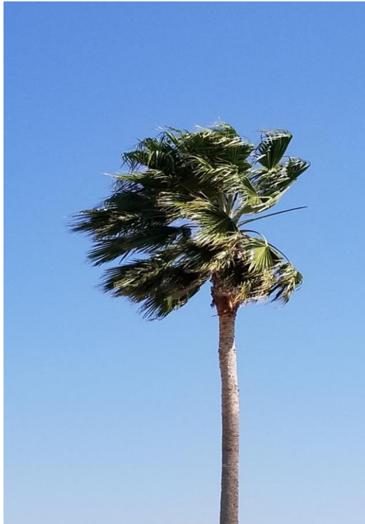
View from Brent and Kathy's window in Texas