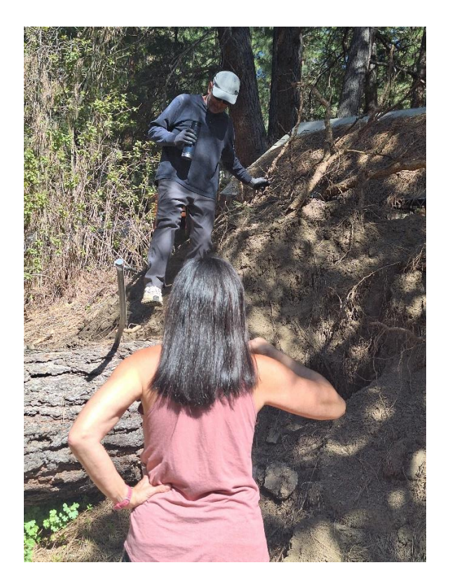
View from Ron and Sandi's lot