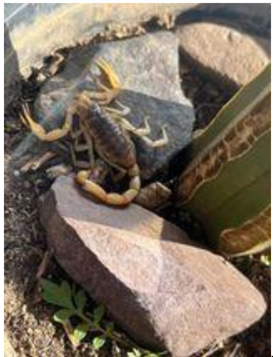
Rock Scorpion at the Magic Circle